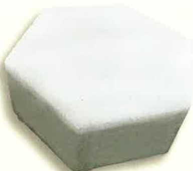
R Series Trafika 80mm White