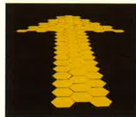
R Series Yellow