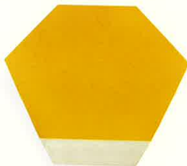
R Series Trafika 80mm Yellow