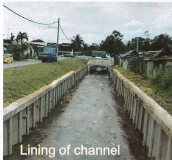
Lining of channel