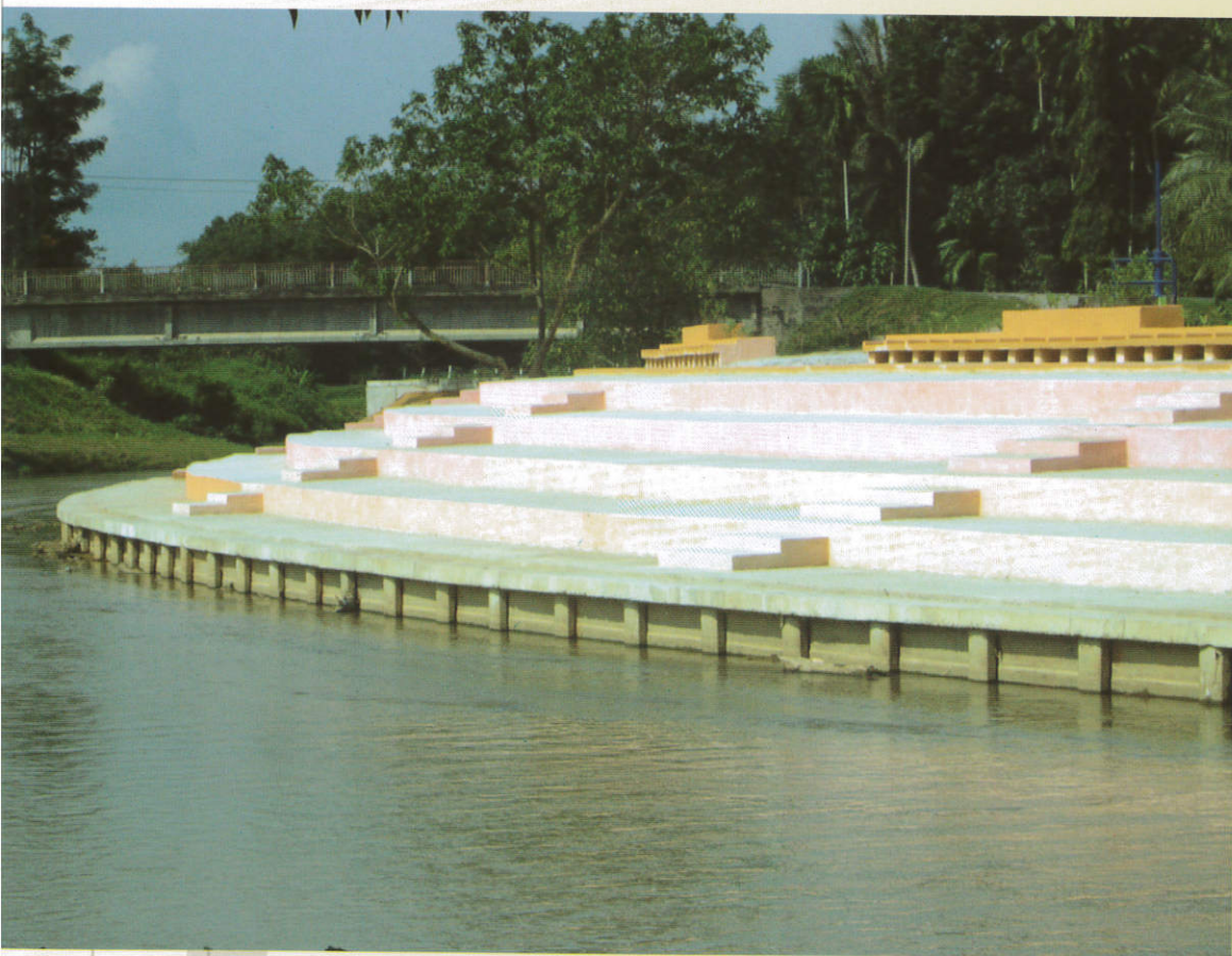
RIVER TOE PROTECTION AND ESPLANADE