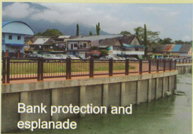
Bank protection and esplanade